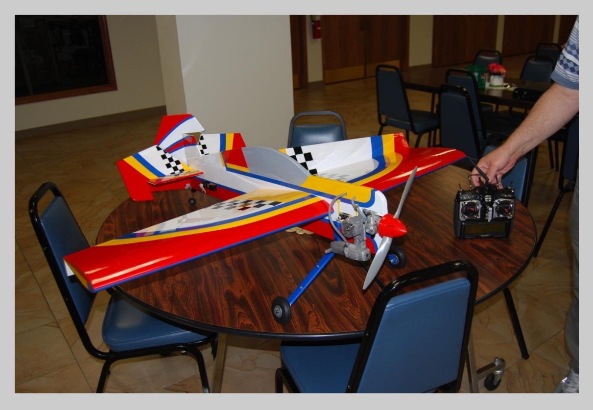
Rich Jenkin's new plane. Check out those control throws.