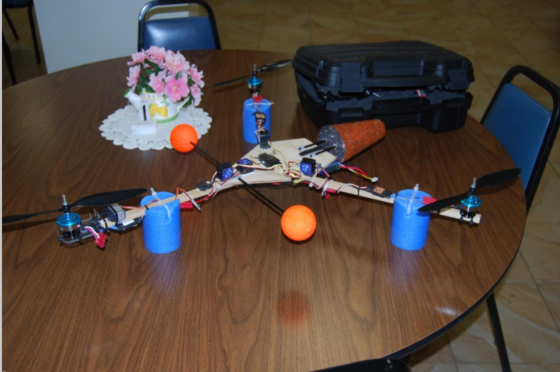
Multi rotor helicopter brought in by a member whose name escaped both the secretary and myself.